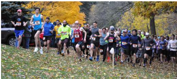
The start of the 10K, 20K, and 30K