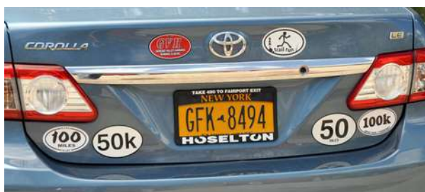
This photo was added by the editor. I saw this car at the spring Webster meet, and I knew right away whose car it was! These stickers represent only some of the many ultramarathon races that Olga has completed!

Favorite orienteering experience... 2015 World Rogaine Championship in Saariselkä, Finland. Located over the Arctic Circle, the area was breathtaking. We ran thru the herds of reindeer and drunk water straight from the lakes and streams