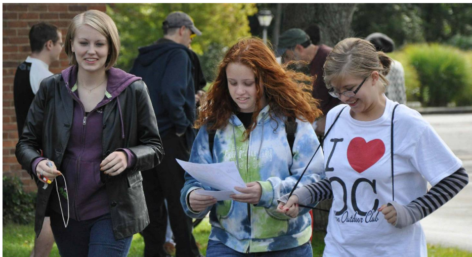
A group from Wilson High School Outdoor Club (OC) heading out on its course on National Orienteering Day in Highland Park.