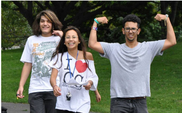
A group from the Wilson HS Outdoor Club, enjoying themselves at Highland Park.