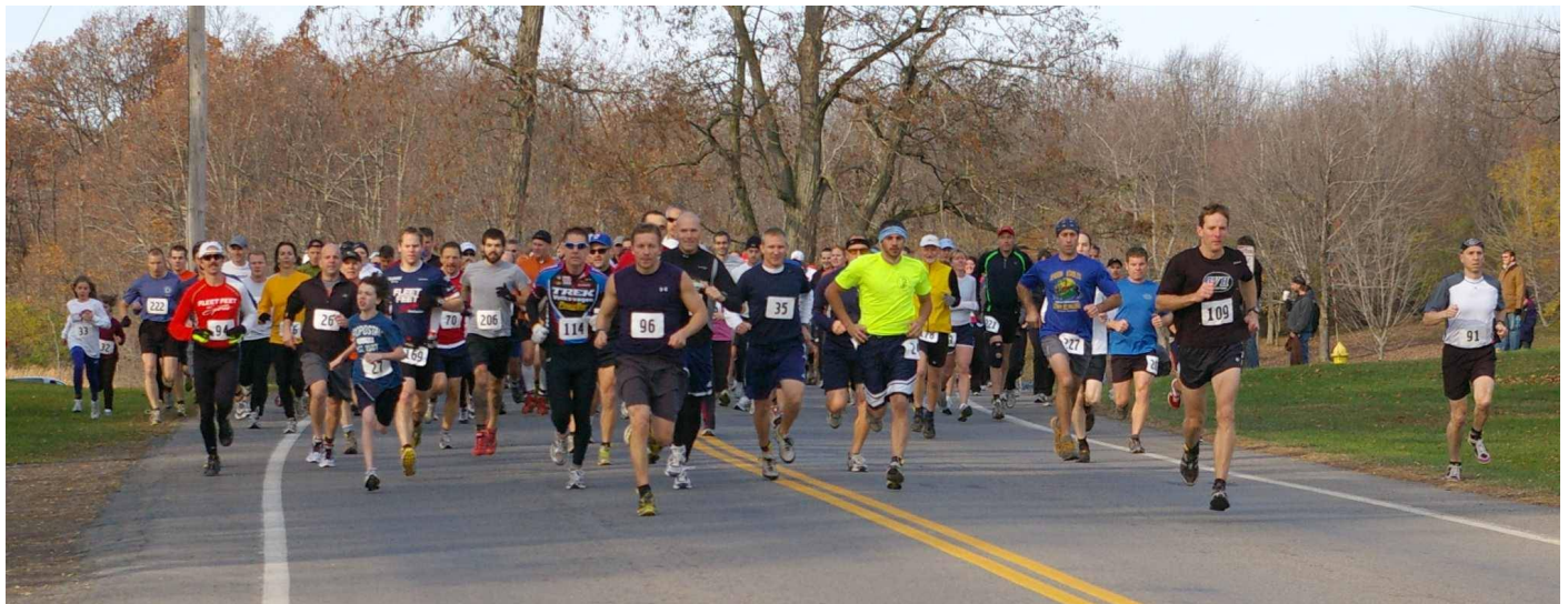
The start of the Mendon Trail Race 5K, 10K, and 20K, November 7, 2009

Rochester Orienteering Club, 40 Erie Crescent, Fairport, NY 14450