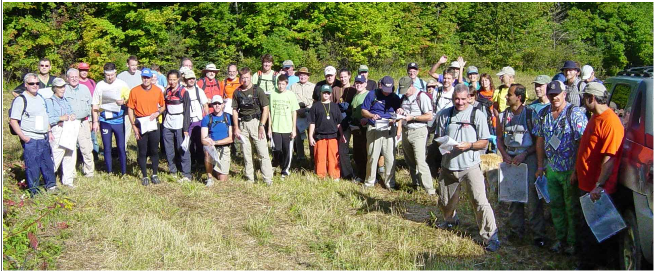
Rogaine 2005 -- The eager participants in the Rattlesnake Hill Rogaine, seconds before the start.